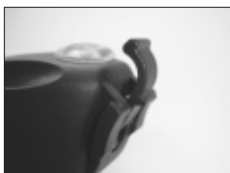
Headlamp mount with release lever

Insert the headlamp mount into the handlebar mount slider clip from the rear of the slider clip forward. Gently rocking the lamp as you slide it may help. Do not push the release lever when inserting the headlamp into the slider clip; let the lamp snap into place by itself.